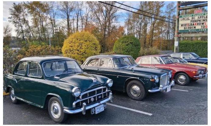
Montage from the July 2025 Chilliwack Downtown Car Show provided by Dan Brien.