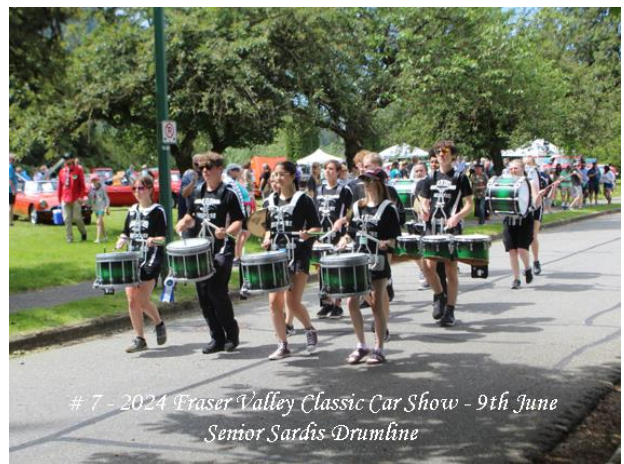
# 7 - 2024 Fraser Valley Classic Car Show - 9th June Senior Sardis Drumline