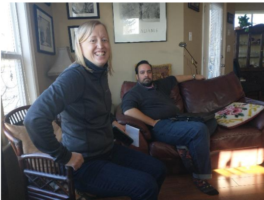
The Fraser Valley Classic Car Show Committee diligently planning the show for 2025.