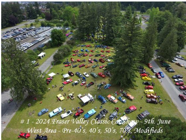
# 1 - 2024 Fraser Valley Classic Car Show - 9th June West Area - Pre-40's, 40's, 50's, 70's, Modifieds

Last year a cheque was handed over to the Fraser Valley Health Care Foundation for $19, 265.