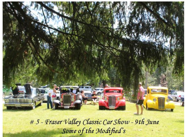
# 5 - Fraser Valley Classic Car Show - 9th June Some of the Modified's