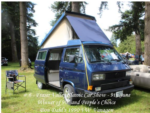
# 6 - Fraser Valley Classic Car Show - 9th June Winner of 90' and People's Choice Don Dahl's 1990 VW Vanagon