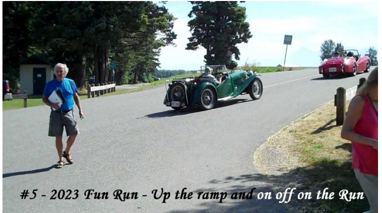
#5 - 2023 Fun Run - Up the ramp and on off on the Run