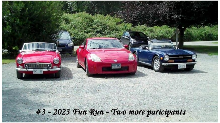
#3 - 2023 Fun Run - Two more participants