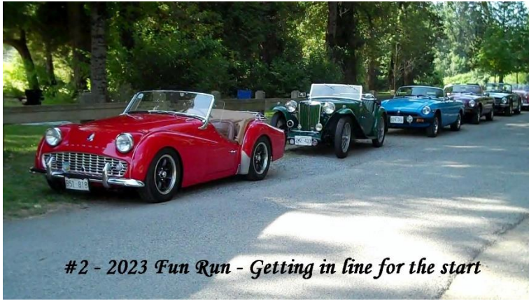
#2 - 2023 Fun Run - Getting in line for the start