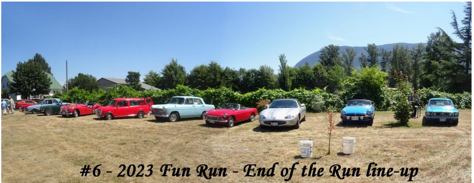
#6 - 2023 Fun Run - End of the Run line-up