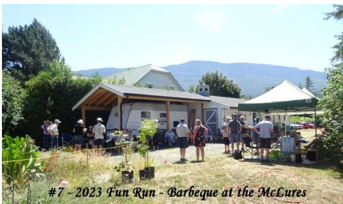
#7 - 2023 Fun Run - Barbeque at the McLures