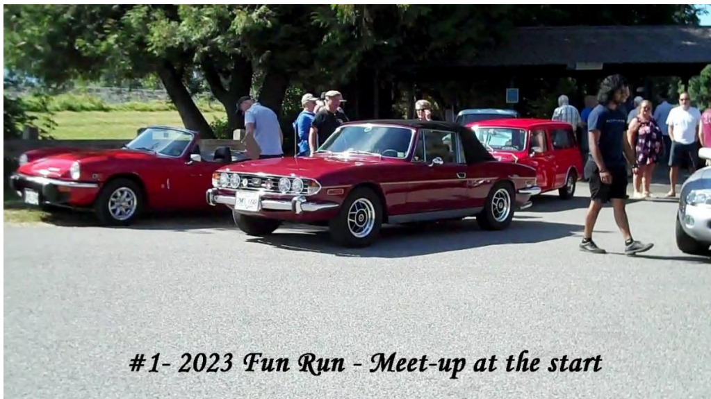
#1- 2023 Fun Run - Meet-up at the start