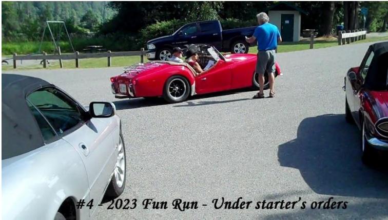
#4 - 2023 Fun Run - Under starter's orders